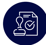
Flexible licensing models

It's everything you need to fully customize an environment to fit your business needs.